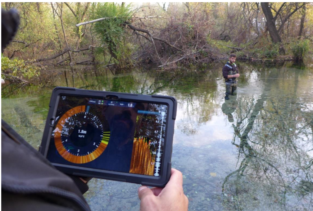
Deeper smart sonar chirp+ measurements display on a tablet