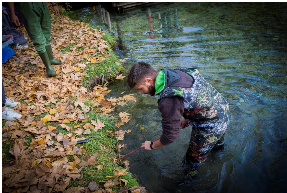
Stream bank erosion pins

The students that participated in the awareness event showed great interest in the project since they got ideas for future semester projects but also were interested to participate in the project as volunteers.