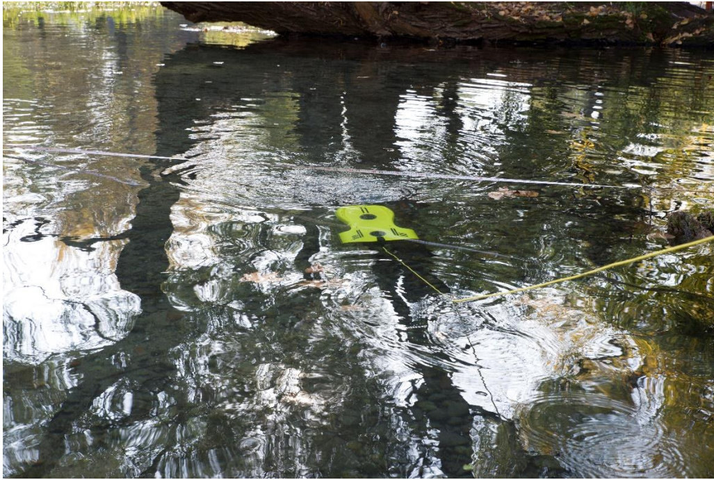
The submarine drone to record and display the underwater stream bank and bed