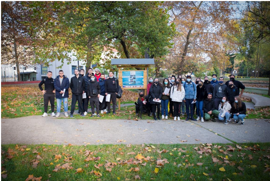
The participants of the event